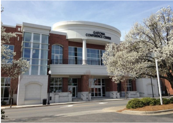
Left: Gastonia Conference Center