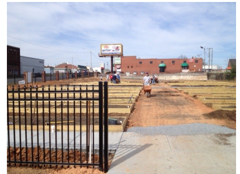
Right: Construction of the Rotary Community Garden

Early in our Club's tenth decade, another big move took place, this time to the brand new Gastonia Conference Center. The Gastonia Rotary Clubs also jointly threw a big New Year's bash at the Conference Center in 2012, with proceeds going to the Rotary Foundation. The club sponsored a third Interact Club at the new Stuart Cramer High School, joining Hunter Huss and Gaston Christian School. As the decade ended and 2020 began, the COVID-19 pandemic brought numerous changes, postponements, and heartaches to our Club and its members. After a brief meeting hiatus, meetings began to be held by Zoom, and club leaders began an effort to maintain contact with isolated members.