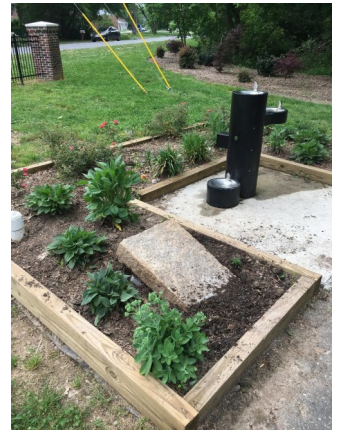
Right: Water fountain at Avon & Catawba Creeks Greenway